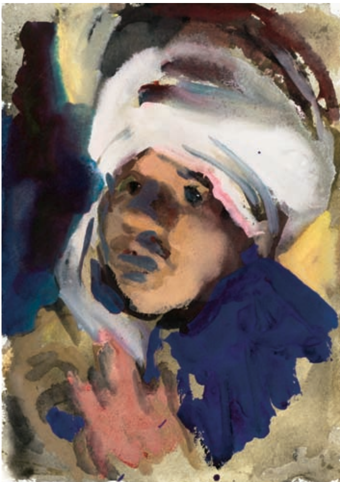
Young boy in the temple (Luxor) 2008 gouache on watercolour paper 21 x 30 cm

Melbourne Art Rooms [MARS] has great pleasure inviting you to the launch of