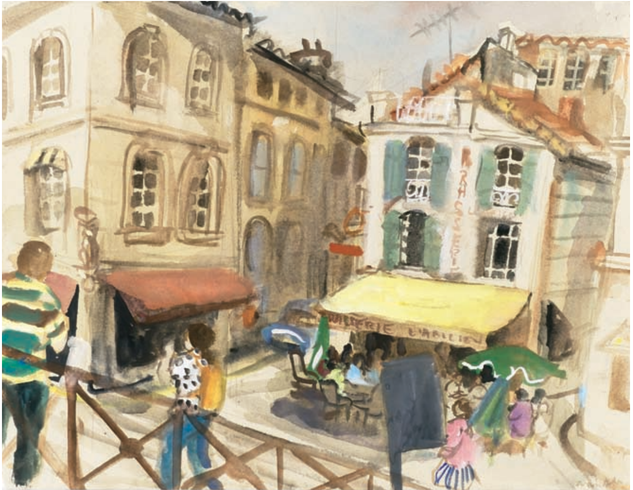
Tourists in Arles (France) 2008 gouache 28 x 36 cm