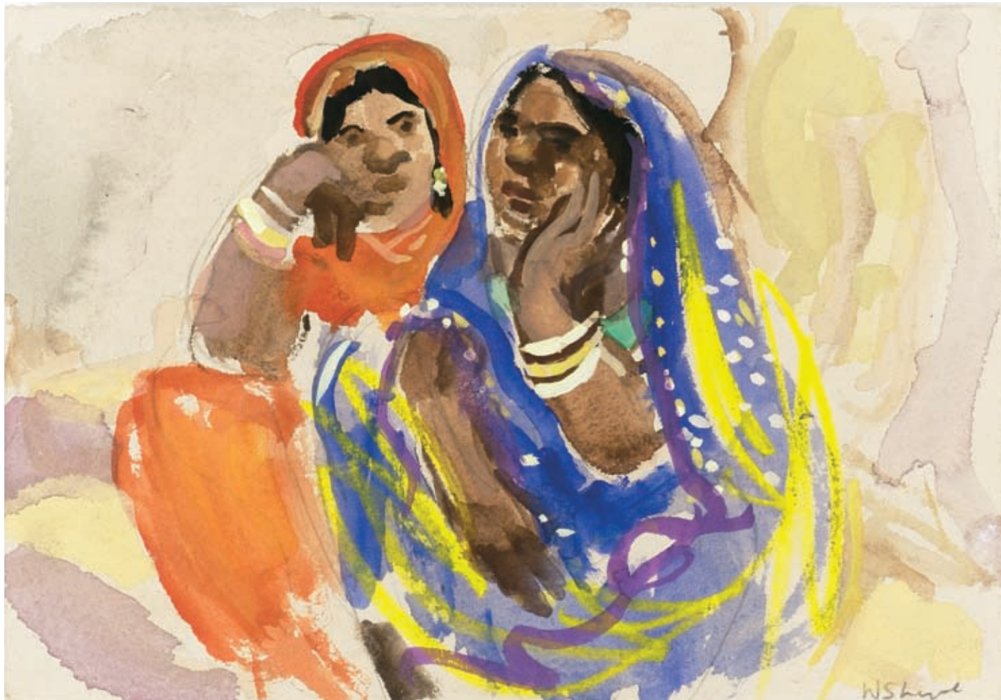
Women in red and blue Saris 2007 gouache 18 x 26 cm