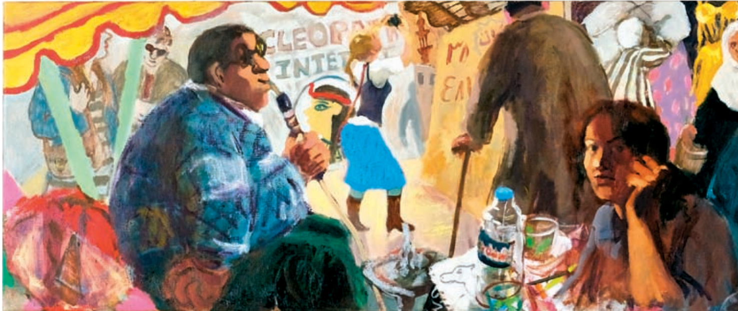
Cairo Cafe 2008 oil on linen 70 x 330 cm