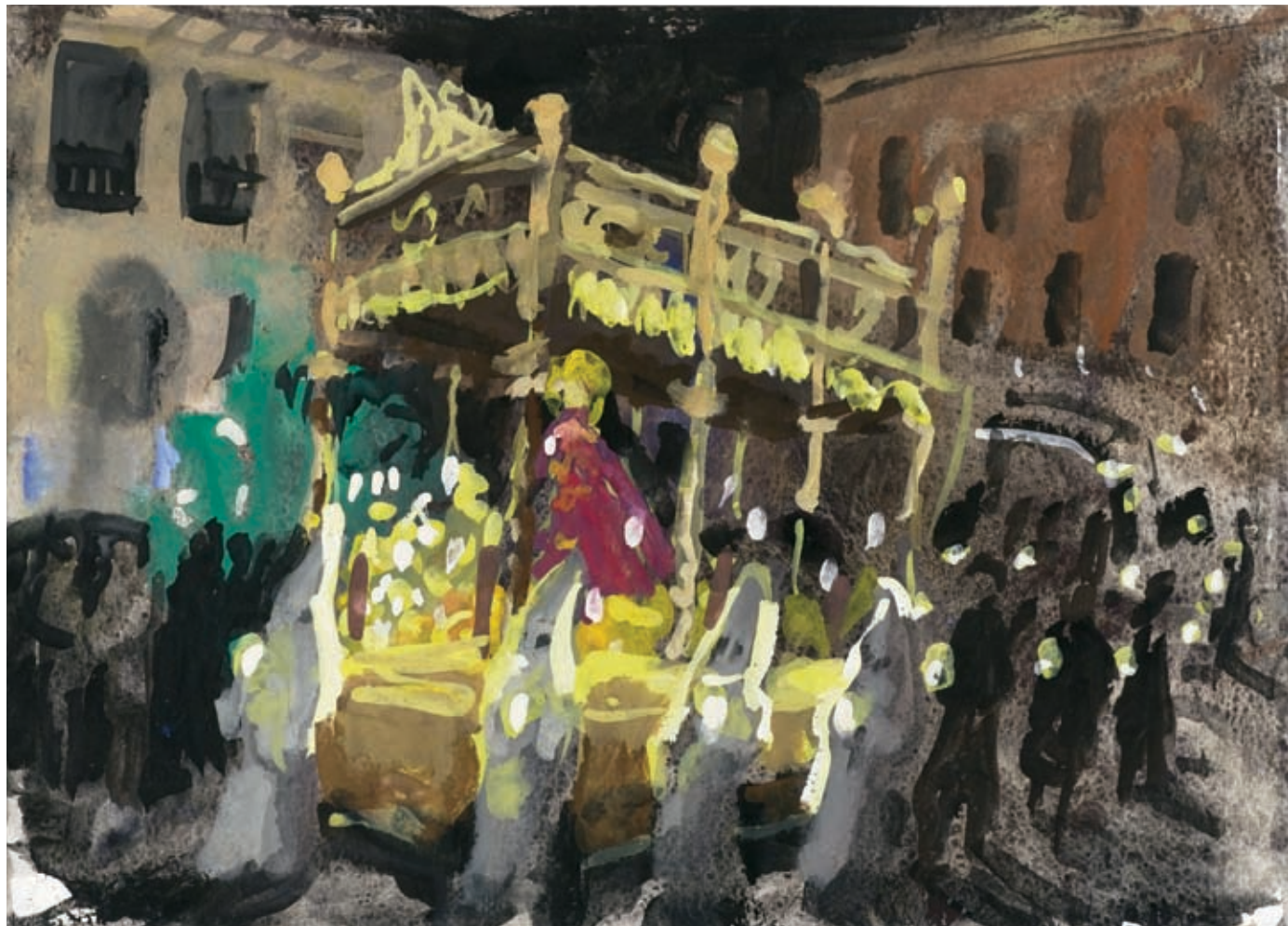
Easter procession with penitents and bridge (Granada , Spain) 2007 gouache on watercolour paper 25 x 35 cm