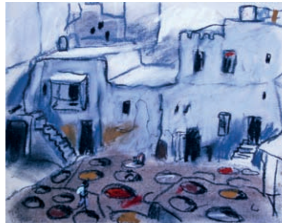
Dyeing Vats (Fez, Morocco) 2006 Pastel 24 x 30cm