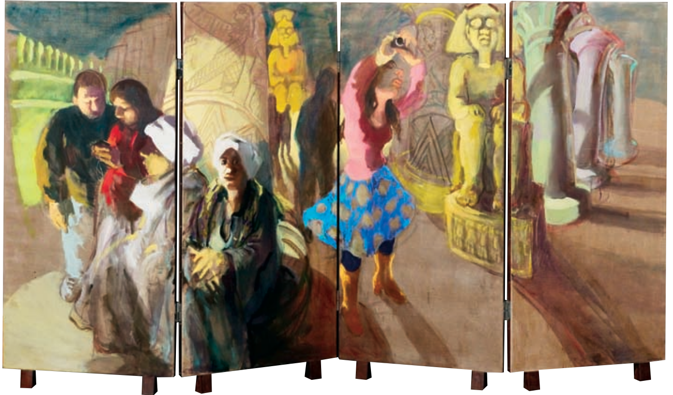
Egyptian Temple 2008 oil on linen double sided 4 panel screen 166 x 320 cm (side 1)