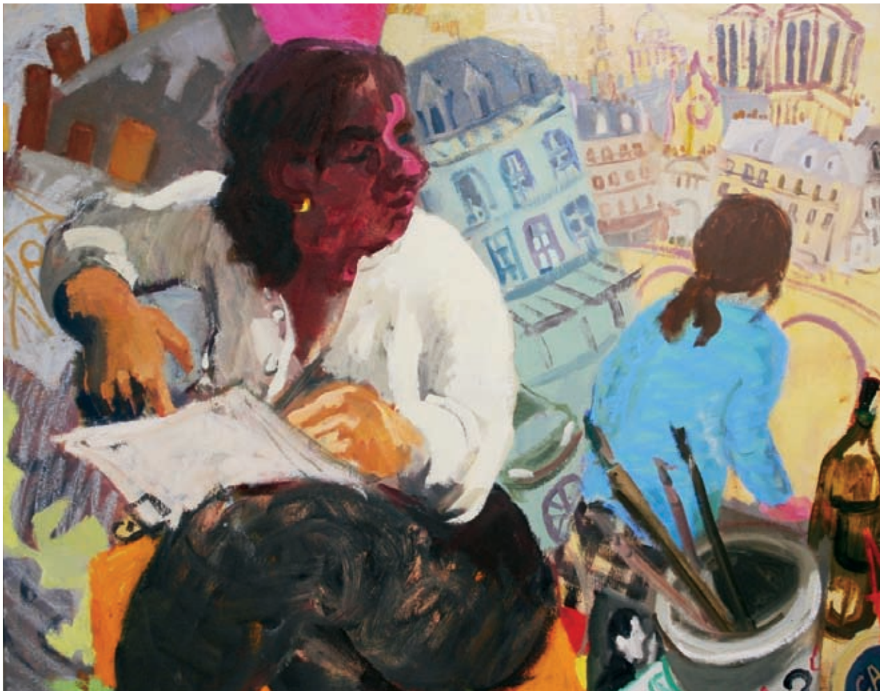
Paris, Past, Present and Imagined 2008 oil on canvas 145 x 180cm