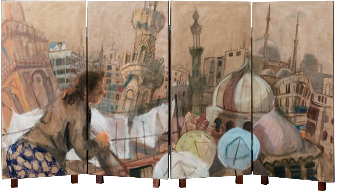
Cairo Roofs 2008 oil on linen double sided 4 panel screen 166 x 320 cm (side 2)